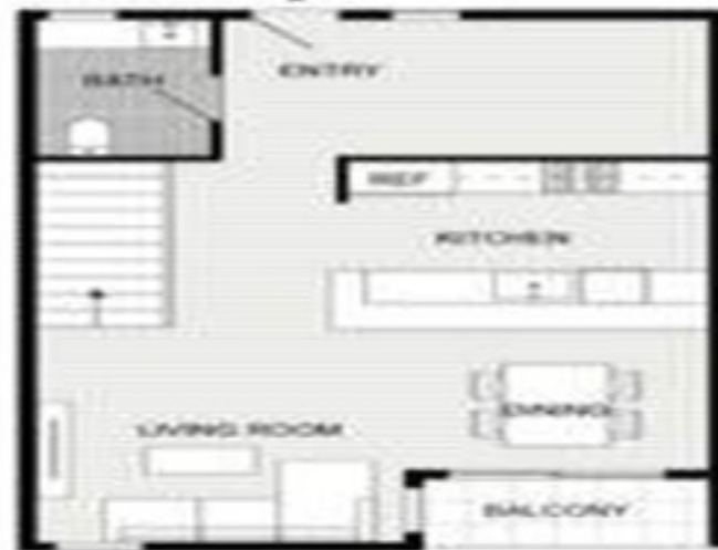
UNIT 303 MAIN LEVEL